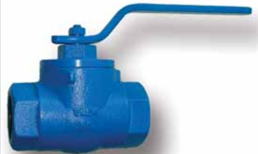
50mm Screwed x 50mm Screwed