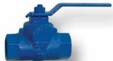
25mm Screwed x 25mm Screwed

Designed and manufactured in South Africa