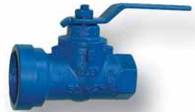
25mm Screwed x 50mm Shouldered / Grooved End