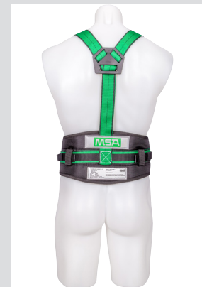
Gravity® Miners Belts