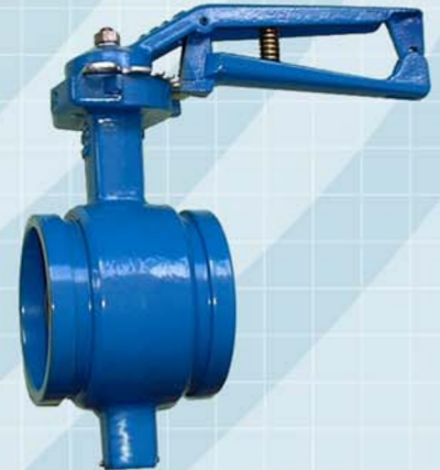
Lever Latch Handle