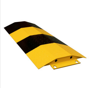
1 meter Body Section - 3mm Steel Speed Hump