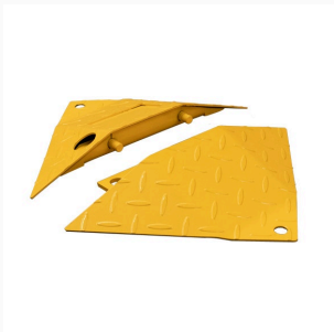
End Cap - 3mm Steel Speed Hump (Pair)