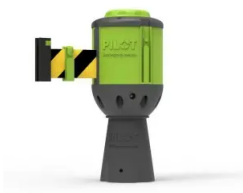
Pilot 10m Belt Barrier